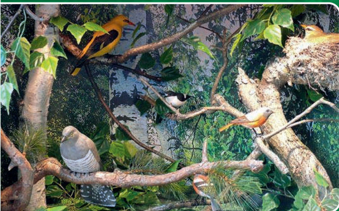
1. Diorama 'The Birds of the Kerzhenskiy Reserve'. Wooden carved birds by E. Emelyanov